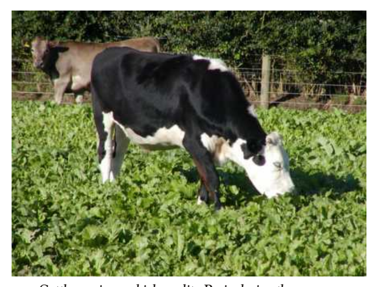
Cattle grazing on high quality Pasja during the summer.