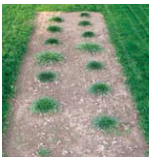
Tall fescue space plants compared to K-31.

AMAZING GS remains a top choice in perennial ryegrass getting high marks in the current NTEP 2008 data with front page results for Golf Course, Athletic Fields and Home Lawn use. AMAZING GS shines in all maintenance schedules from high to low and in all regions throughout the U.S. AMAZING GS remains at the top of Gray Leaf Spot ratings with an 8.7 out of 9 rating. AMAZING GS has a dark green color, dense upright growth, slower growth habit for less mowing and excellent overall disease resistance. The data is in and it proves AMAZING GS is the right choice in perennial ryegrass.