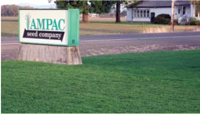
AMPAC's newly seeded tall fescue.

package. Planted as a mono stand or mixed with Cochise IV this is a new generation variety that should be in everyone's line up.